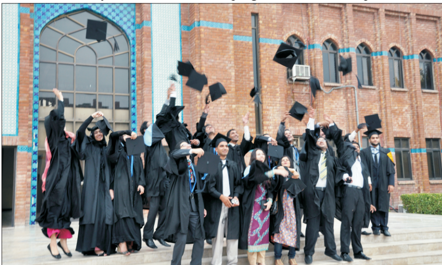
Students are celebrating after getting their degrees at the Convocation

According to him, a total number of 534 students passed out in this convocation including BBA, BS(CS), BS(CE), BS(TE), MBA, MS(CS, EE, Math, SPM) and PhD programs.