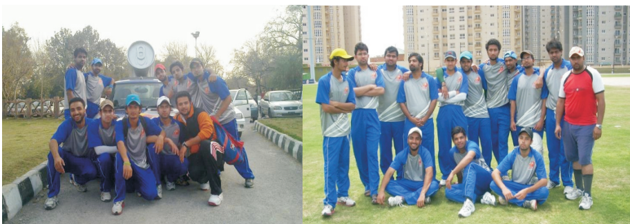
FAST Islamabad Cricket Club players are posing for photographs

FAST Islamabad cricket club also won gold medal in FAST tri-sports fixture held at FAST-NU Islamabad Campus and silver medal in LUMS sports fixture held at Lahore University of Management Sciences, Lahore.