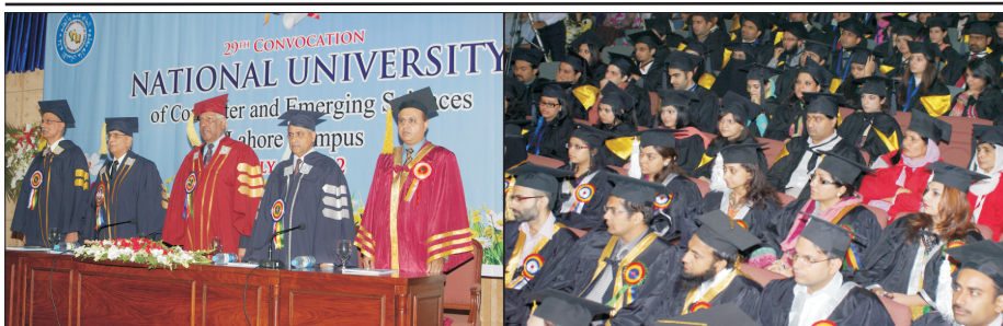
29th Convocation held at FAST-NU Lahore Campus

The Higher Education Commission (HEC) has decided to award 6,000 scholarships to talented but financially strapped students from different parts of the country during the next three years. The need-based scholarships are aimed at providing opportunities to under privileged students, possessing academic merit, but unable to finance their education, to have access to higher education. Under this new initiative, special emphasis is given to the students belonging to Balochistan, FATA, interior Sindh and Southern Punjab. So far 1,000 need-based scholarships have been awarded to the students belonging to different parts of the country.