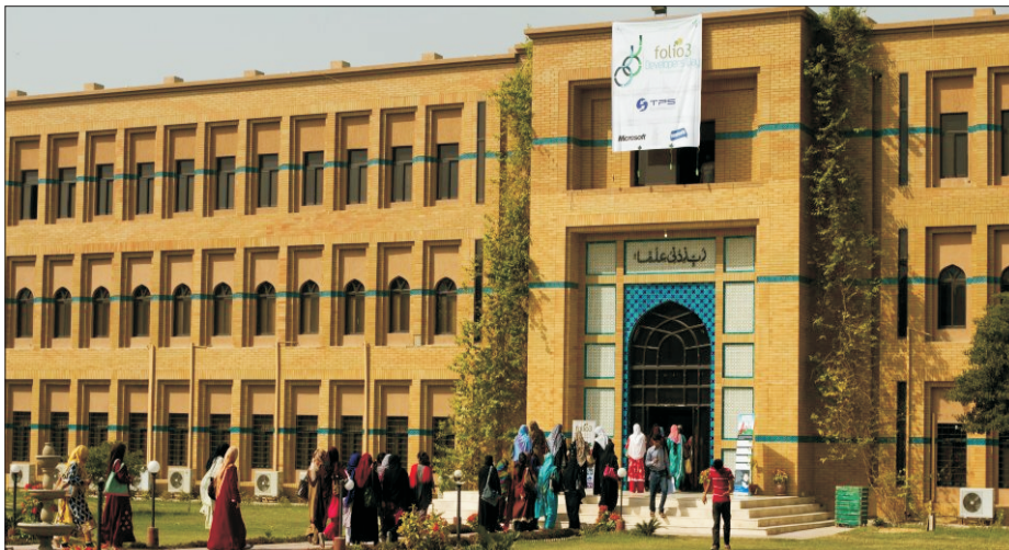
File Photo of FAST-NU Karachi Campus

50 students were paid Rs.66,500 each while 27 got Rs.70,000 each.