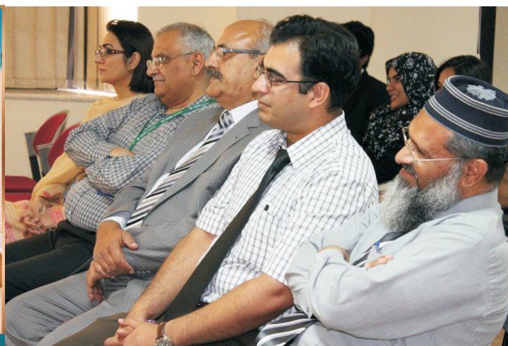
Participants of career development workshop organized at FAST-NU Islamabad Campus