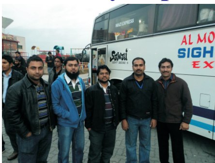
Students are posing for photograph

NFT (NUCES Fun Trekkers) FAST-NU Lahore Campus arranged a one day adventurous tour to Khanpur. The students left Lahore for Khanpur on March 3, 2012. All students visited ancient Buddhist monastery of Morha Morado. They went to Taxila Caves for underground cave exploration.