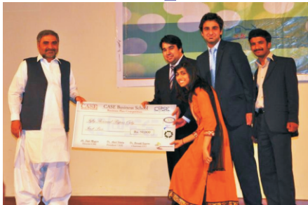
Winning students are receiving prize from the chief guest

CASE Spark competition was held on April 7 and 8, 2012. Around 30 teams from the twin cities participated in the event. A number of competitions such as Case Study, Business Plan,