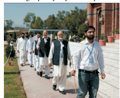
Participants of Peace Walk at FAST-NU Peshawar Campus

event of creating awareness and building capacity of youth for peace.