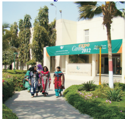
A group of students are coming out after attending career expo

FAST-NU Karachi Campus has participated in "Career Expo 2012" on April 01, 2012 organized by Aga Khan Higher Secondary School, Karachi (AKHSS). The Expo provided some 5000 students and parents an opportunity to interact with renowned higher education institutions. FAST-NU Karachi Campus participated in this event in connection with Admission's 2012 campaign. This Expo was largely attended by students of various colleges and schools of Karachi, especially of the Aga Khan Community.