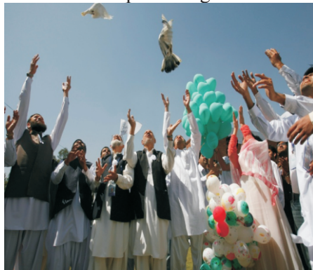
Students are setting free pigeons and balloons during Peace Day

The students of FAST-NU Peshawar Campus arranged several