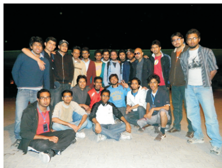
A group of students during visit to Khanpur

Then all students drove through the scenic Khanpur valley towards Harripur for Para Gliding followed by a boat ride across the turquoise blue water of Khanpur Lake. Later, the students departed for Lahore via Islamabad Motorway.