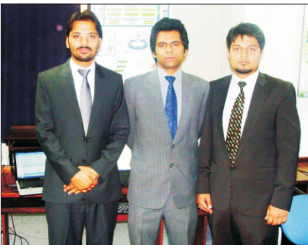
Three participants of Open House

The 2012 Open House, the first ever two-day event was held at FAST-NU Islamabad Campus from April 25 to 26, 2012. The idea behind holding this event was to pay extra attention to each department and to further deepen the understanding and relationship with the concerned industries. About 30 organizations comprising national and multinational names and almost 90 students participated on the first day of the event. On the second day,