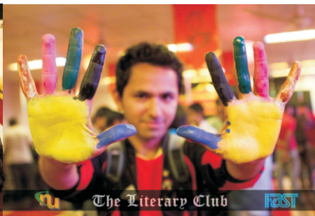
Students are showing enthusiasm at Xpressions 12 held at Karachi Campus