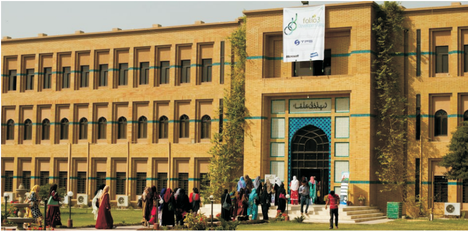
Students are going to attend Folio3 Developers Day at Karachi Campus

Folio3 Developers Day 2012, organized by Association of Computing Machinery (ACM), was held at FAST-NU Karachi Campus on March 15, 2012. The event was organized to benefit and progress the