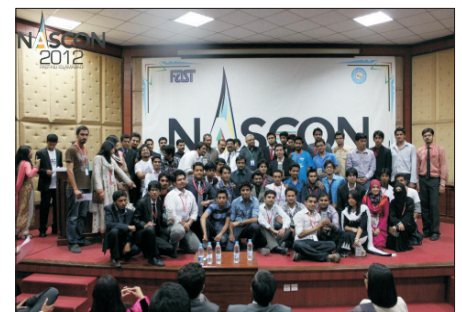
Students at auditorium of FAST-NU Islamabad Campus

FAST-NU would be the only team to represent Pakistan. Others teams will be from universities of India, Sri Lanka, Bangladesh, Australia, Malaysia, Thailand and China.