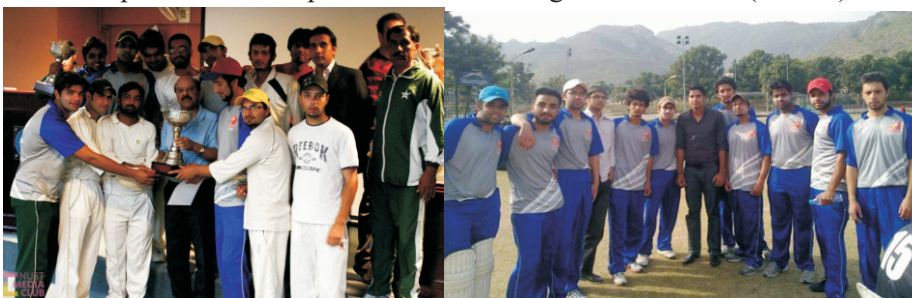
FAST Islamabad Cricket Club team with winning trophy

Intervarsity tournament. FAST Islamabad cricket club won gold medal in FAST tri-sports fixture held at FAST-NU Islamabad Campus and silver medal in LUMS sports fixture held at Lahore University of Management Sciences (LUMS).